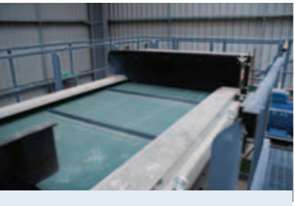
Ferrous/Non Ferrous Removal