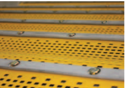
Flip Flow Screen