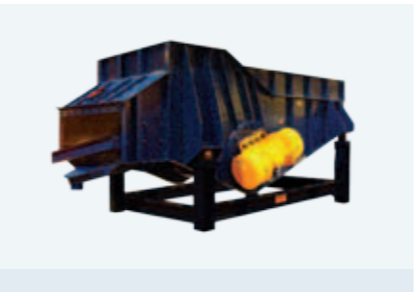
General Kinematics Air Classifier